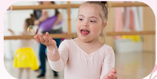
Feel the Beat! Dance Program

Special Olympics Wellness & Martial Arts Program Tai Chi for Health