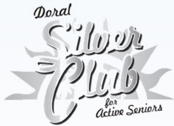
Socials & Social Hours