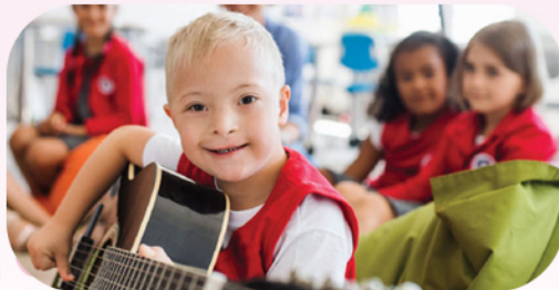
Mind & Melody Music Program

Special Olympics Wellness & Martial Arts Program Tai Chi for Health