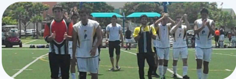
1. Adult Soccer League