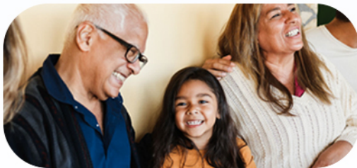
Seminar & Luncheons