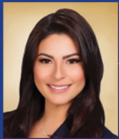
MAYOR CHRISTI FRAGA

Christi.Fraga@cityofdoral.com 305-593-6725 x7000