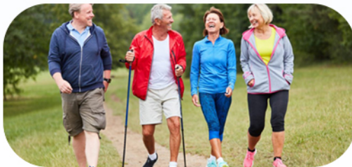
Walk with Ease Program