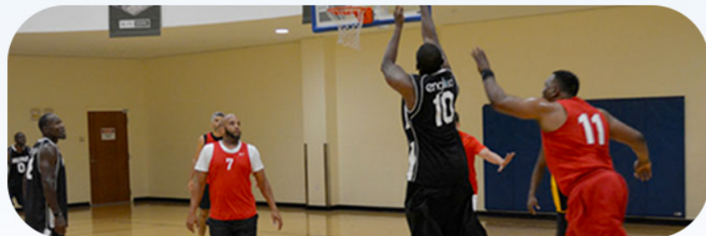
2. Adult Basketball League