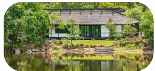
Trips & Tours