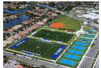
Doral Legacy Park (18 acres)