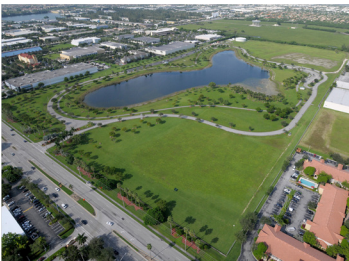
DORAL CENTRAL PARK CLOSED FOR CONSTRUCTION