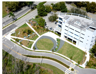
MAU Park (.68 acres)