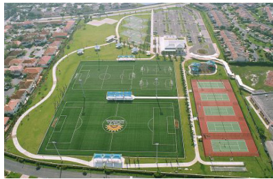
Morgan Levy Park (14 acres)