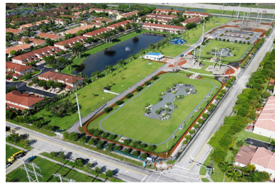
Trails & Tails Park (8.3 acres)