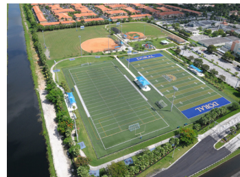
Doral Meadow Park (14 acres)