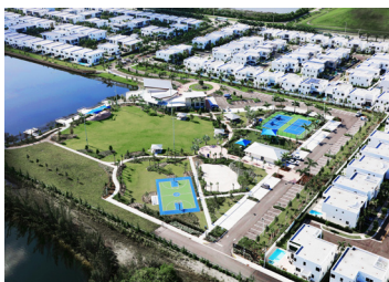
Doral Glades Park (25 acres)