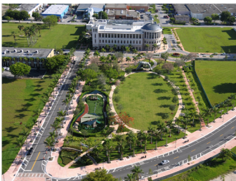
Downtown Doral Park (3 acres)