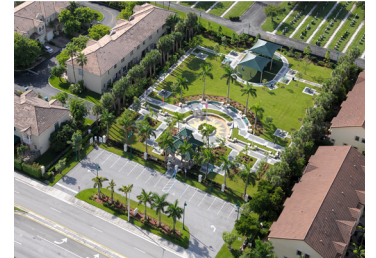
Veterans Park (1.3 acres)