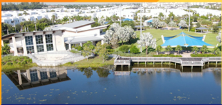
Doral Glades Park