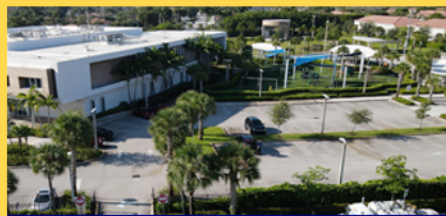
Doral Legacy Park