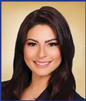
MAYOR CHRISTI FRAGA

Christi.Fraga@cityofdoral.com 305-593-6725 x7000