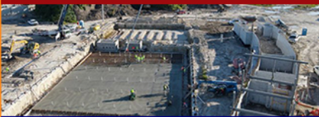
Doral Central Park

IT STARTS IN PARKS Coaching. Connecting. Community.