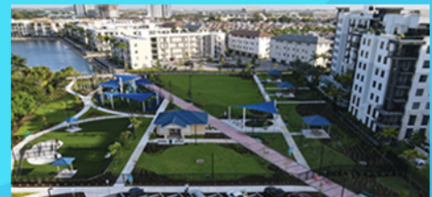
White Course Park