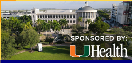
Downtown Doral Park