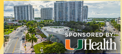
Doral Cultural Arts Center

IT STARTS IN PARKS Coaching. Connecting. Community.