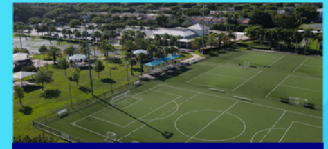
Morgan Levy Park