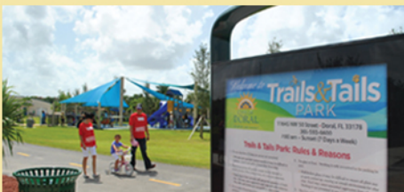
Trails & Tails Park