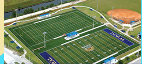
Doral Meadow Park